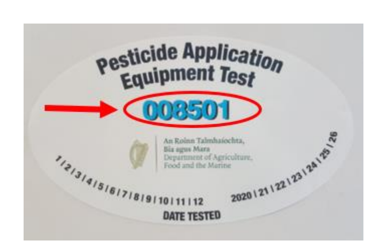
Figure 2. PAE Test Number.